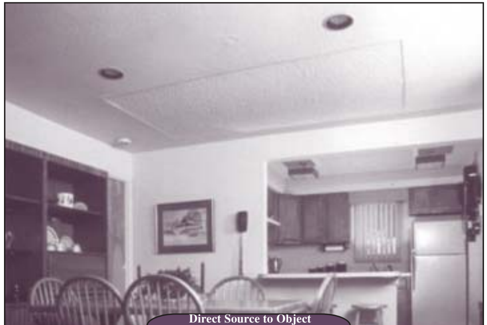
Direct Source to Object Radiant Heating Panel

Under a grant from the U.S. Department of Energy’s (DOE’s) Inventions and Innovation Program, Solid State Heating Corporation, Inc., commercialized a flat, lightweight radiant heating panel that directly mounts to walls or ceilings without expensive mounting brackets. The radiant heating panel includes a steel or aluminum casing, an insulated back, and a front surface that readily transmits infrared radiation from a patented electric-heating element. The heating element consists of two electrodes that deliver electricity to conductive material laminated between two layers of polyester film or a solid state heating element.